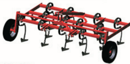
"HD" S-Tine Fitted